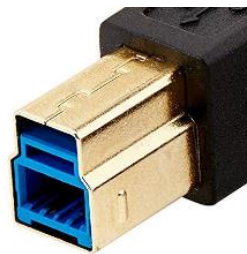
High Speed USB-B

If you use a low-speed cable, the throughput of the four USB-A 2.0 connectors on the Simple-C board may be limited.